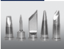
Replacement Soldering Tips W Series